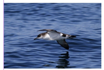
Manx Shearwater.

most of their natural environmental assets by enhancing access and visitor enjoyment, thus serving to boost local incomes at the same time as securing the future of seabirds on the archipelago.