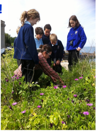
St Agnes schoolchildren assisting with a Scilly Shrew survey. They have pledged their support to carry on monitoring shrews as part of the seabird project .

Do contact the team (see over page) to register your interest, whether it be in simply posting leaflets or regular hands-on active conservation work – there is scope for both. The choice is yours!