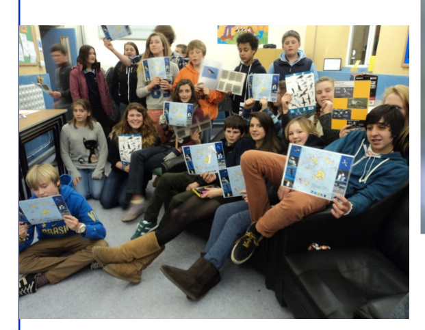
Youth Hub members in support of the project.

The Local Authority's Extended Services 'Youth Hub' also gave a thumbs-up to getting involved and backing the project. 'Youth Hub' members are always keen to learn more about and explore the natural environment on Scilly and they are currently looking forward to finding out more about the islands' seabird heritage as part of their out of school activities.