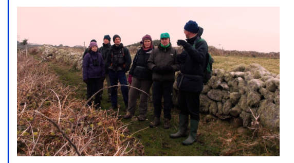
'Sirens of the sea' walks as part of Walk Scilly.

Braving bitter easterly winds, the walks were based on St Agnes and St Mary's. Taking in the beautiful beaches and cutting across the heathlands on both islands we glimpsed the first signs of spring along these coastal habitats, not least by the picture of kittiwakes returning to their nest sites on cliffs beneath the Turk's Head pub—welcome back kittiwakes! Each walk was enjoyed by everyone, the first of many such project activities.