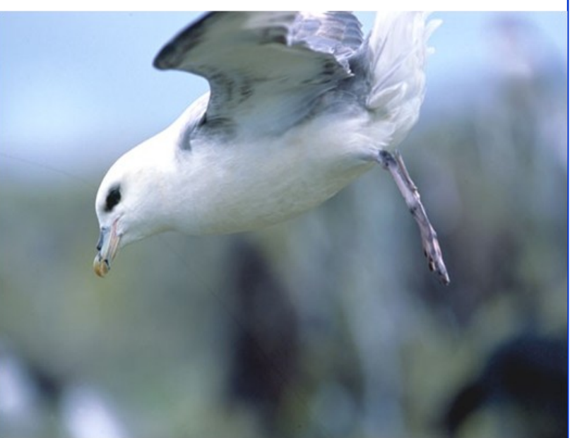
Northern Fulmar in flight.

Head of the LIFE Nature Unit within the European Commission, Mr Angelo Salsi, said; "I am delighted that EU life funding will allow restoration of the islands for the benefit of seabirds. These islands form a vital part of the Isles of Scilly Special Protection Area, which in turn is part of the EU-wide Natura 2000 network of sites, including all the best and most valuable examples of our common European natural heritage. The work that the team will carry out will be of great benefit to the seabirds that breed on St Agnes, Gugh and the neighbouring island of Annet, and will also help to improve the quality of life of the people who live on St Agnes and Gugh."